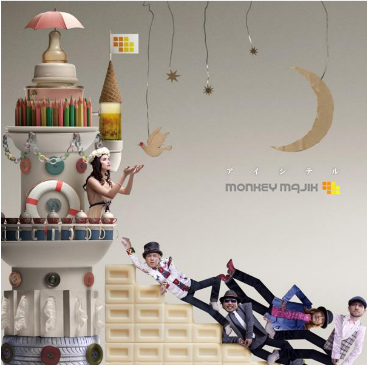
Blaise Plant, middle, is a rock star in Japan.

No Monkey business here - Keyano VPA alum makes it big in Japan