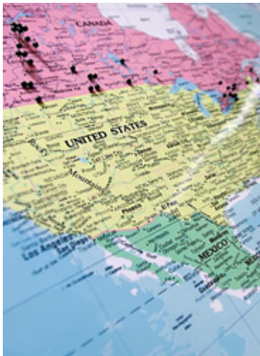
Where In the World Were You Born? Participate today.

That would be Karachi, Pakistan for me. How about you? Keyano staff and faculty are invited to partake in a new initiative called Where In The World Were You Born?